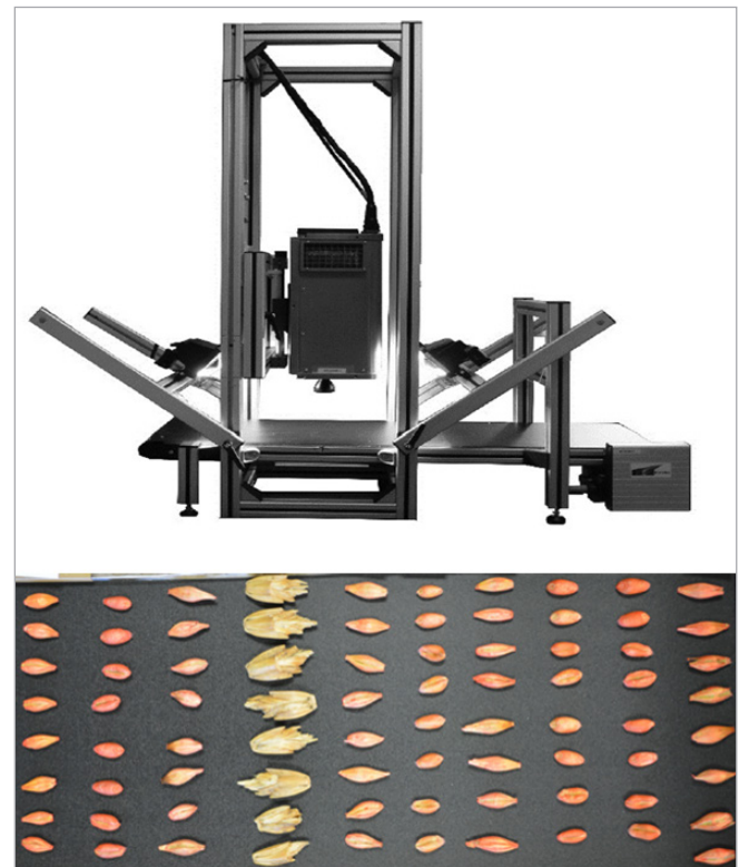
Figure 1. NIR hyperspectral imaging system and multi seeds presentation to the conveyor belt (eight seeds per sample).

The image treatment involved building libraries for each class of species, treated/not treated status and group of pesticides. To extract the data from the image, a mask to isolate the seeds was built. The first step consisted of detecting and removing the pixels/spectra in the