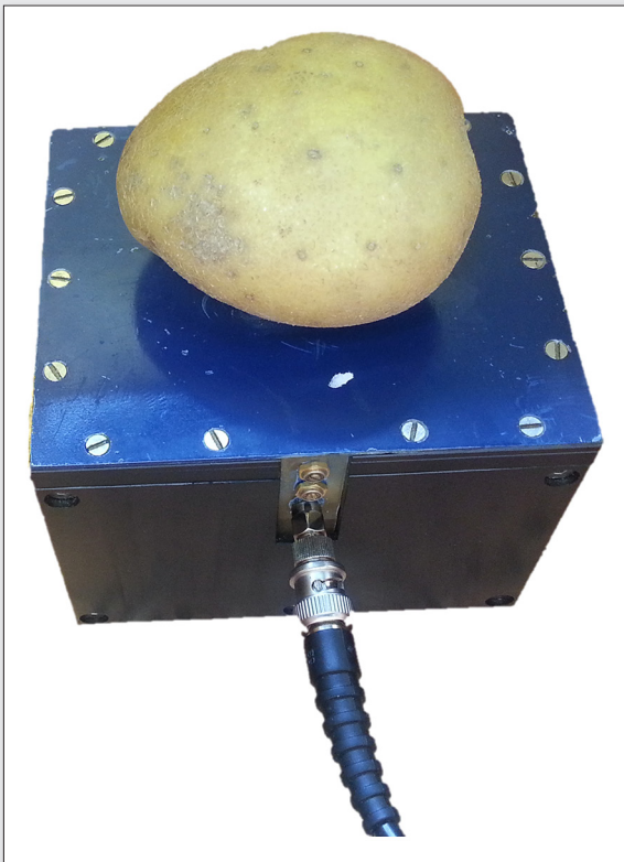
Figure 1. A photograph of the Profile NMR-MOUSE® with a potato placed on top of it. This was the experimental set-up for the magnetic resonance experiments conducted within this study.

placed whole potatoes on the surface of the instrument for measurements (see Fig. 1).